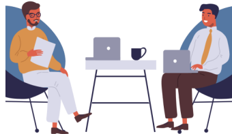
RecordsOnline's state-of-the-art platform is fast, accurate, and proactive!

The Title Company then conducts a search of their own records, or